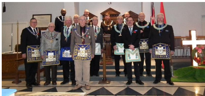
Memorial No. 172 Moose Jaw, Saskatchewan.