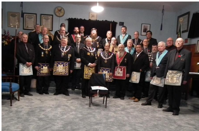
Bigger No. 100 Biggar, Saskatchewan.