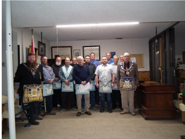
Briercrest-Drinkwater No. 88 Briercrest, Saskatchewan.