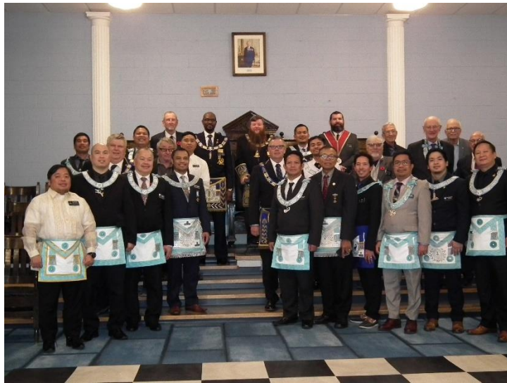
Saskatoon-Central No. 217 Saskatoon, Saskatchewan.